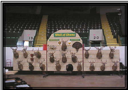
TIP Indoor Wall of Shame.

TIP was started in 1981 by a group of concerned CITIZENS and averages 1,000 calls per year referred to Conservation Officers, over 400 arrests made annually and over $6,000 paid in rewards each year.